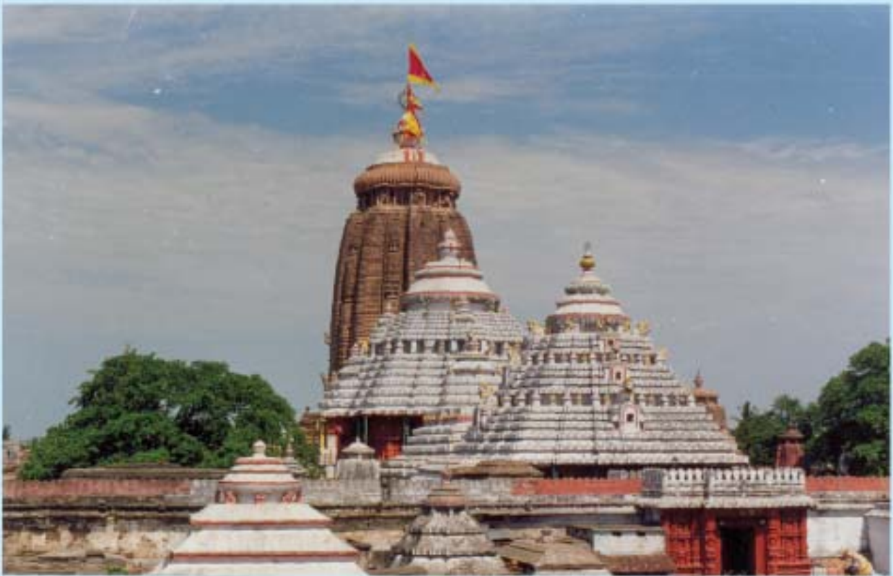
Jagannath Temple, Puri