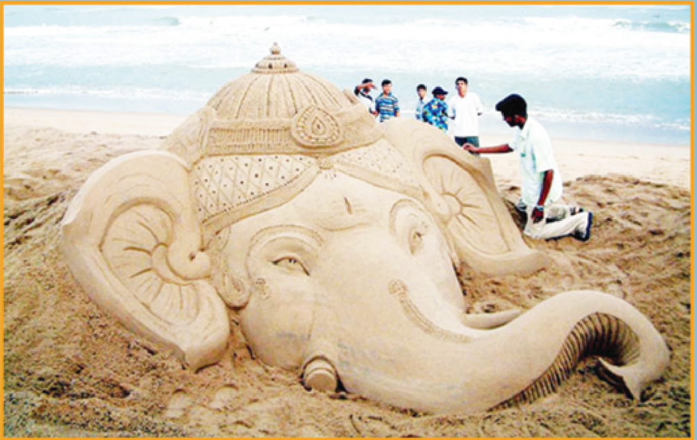
Sand Art Festival, Puri Sea Beach