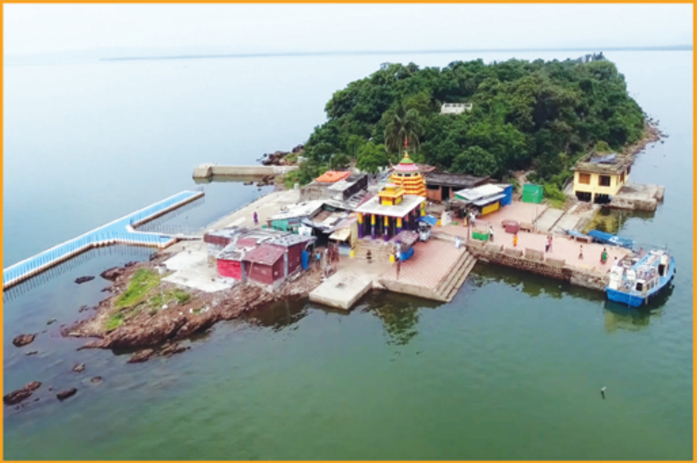
Kalijai Temple, Chilika