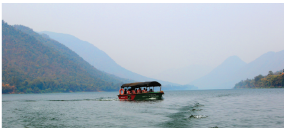
Satakosia George Sanctuary