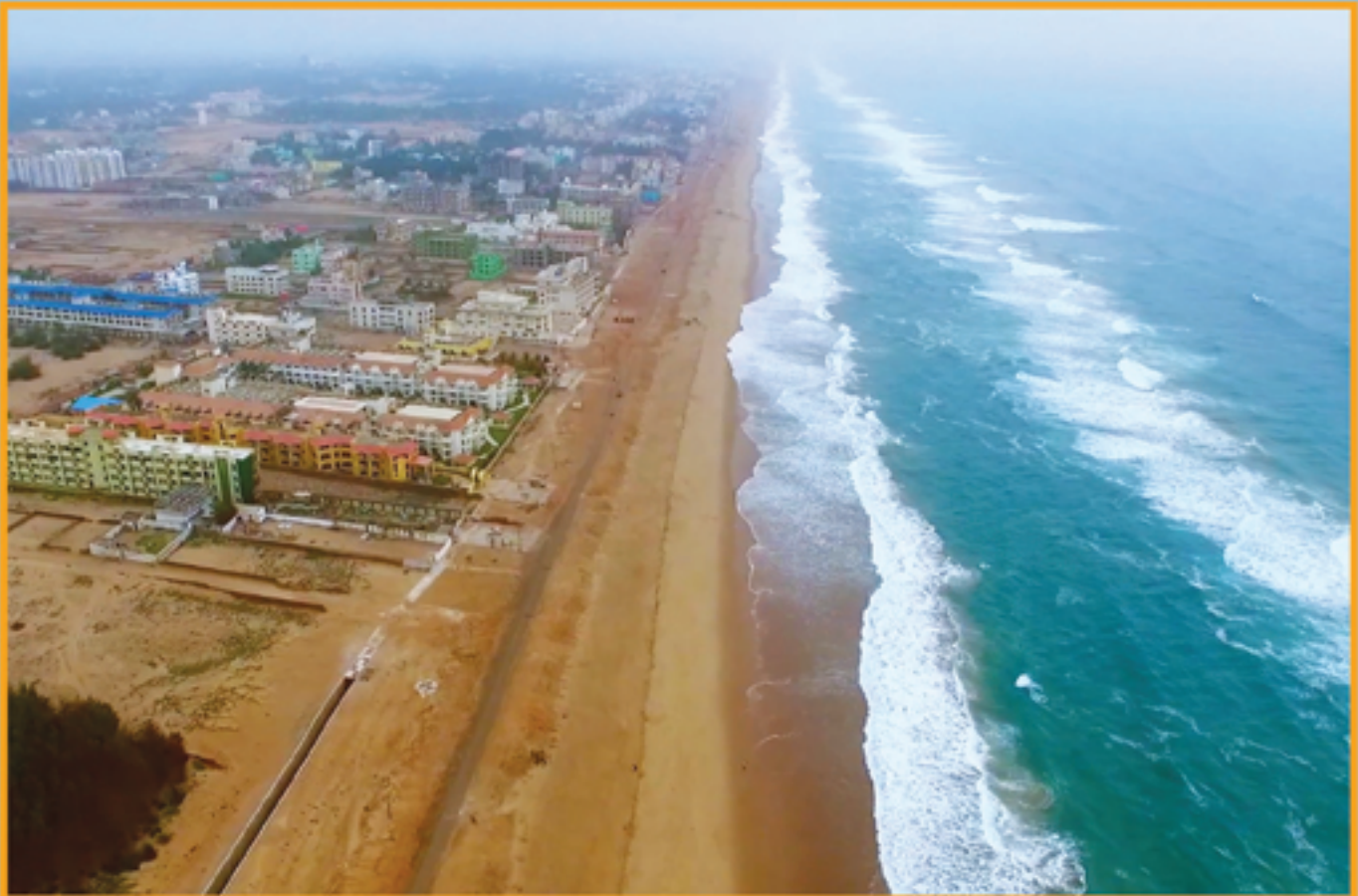
Gopalpur Sea Beach